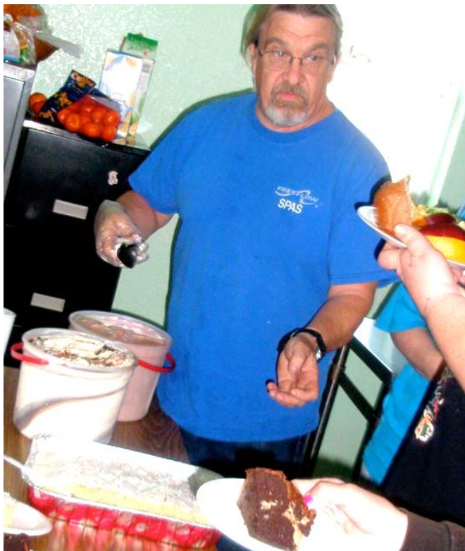
servicing ice cream & cake in April