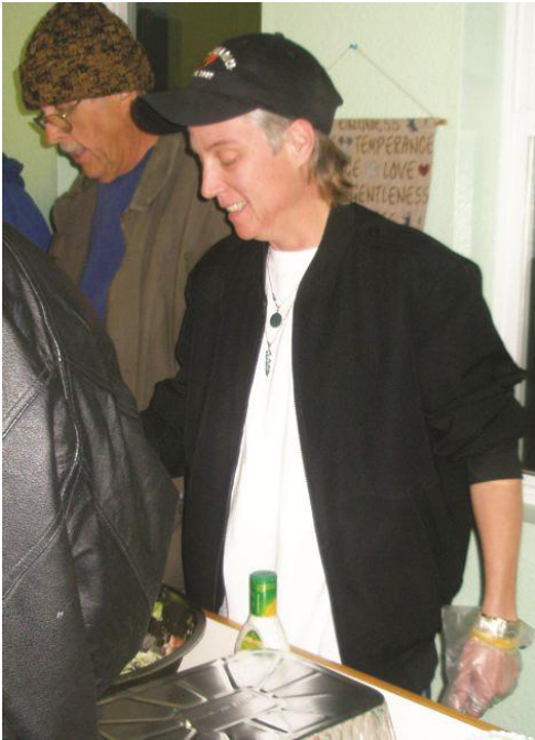
serving the March 12 th Shelter Meal