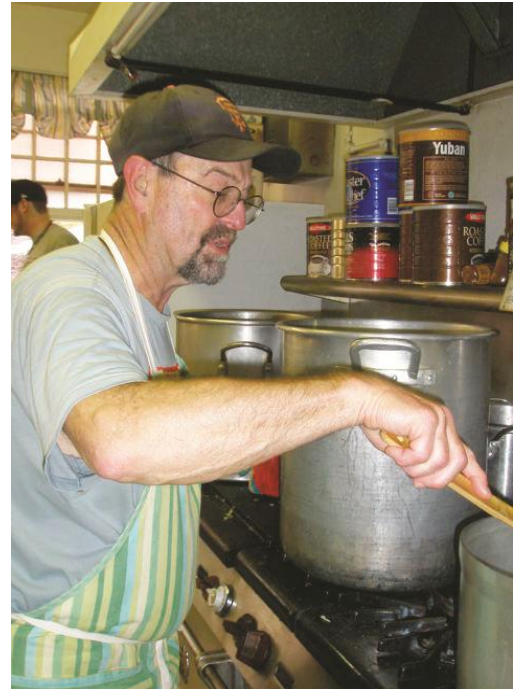
St. Patrick's Day Lunch Chef